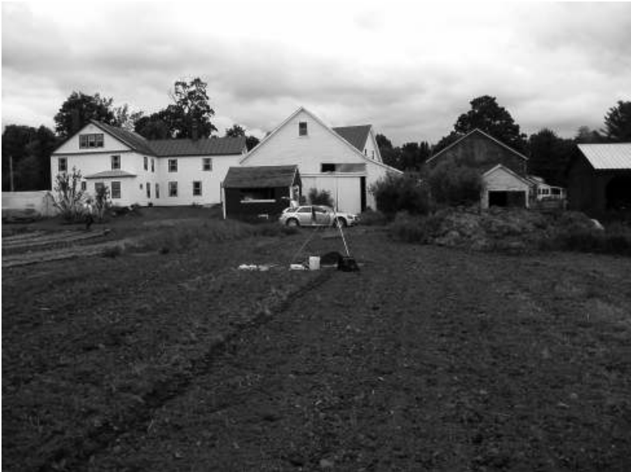
Figure 1. View to the north of the cultivated ground proposed for the high tunnel and tested with a walkover and shovel testing.

the future, might include the addition of appurtenances like buried irrigation pipes that could impact archaeological resources. Accordingly, it seemed warranted to examine that part of site 38.10 where the high tunnel would be set so as to provide information for any historic preservation conditions needed for installation of the farm structure.