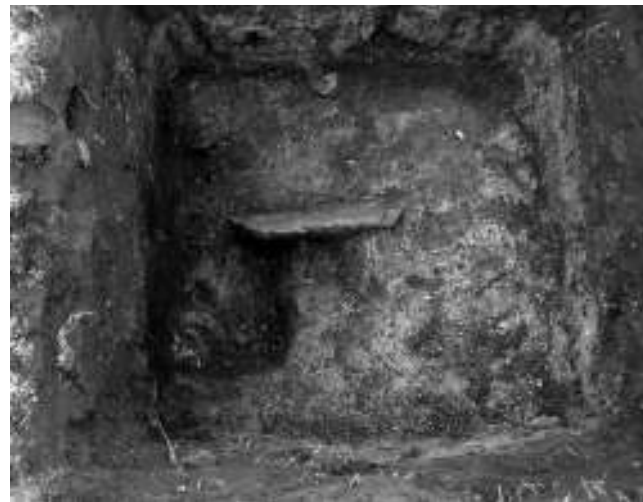
Figure 3. STP 10m with feature fill removed from the floor (in the B horizon) at 43 cm to 53 cm below surface (north at top). Note standing rock adjacent to feature.