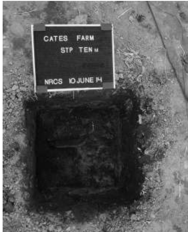
Figure 2. STP 10m (50 x 50 cm) with the surface (in the B horizon) at 43 cm below surface and the dark feature along the west (left) wall.

Processing of Feature 2014 began with flotation of 3.1 kg of moist fill in a clean tub with water, agitation of the fill with a plastic rod, and recovery of a light fraction from the water’s surface with a clean brass testing sieve (no. 60 mesh or 250 micrometers). The non-floating heavy fraction was placed on 1 mm mesh hardware cloth and water-screened. Following drying, the fractions