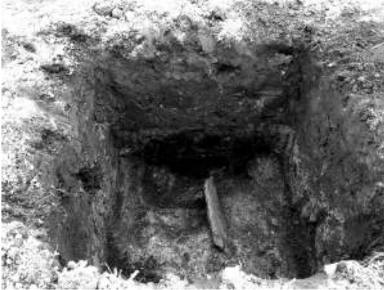
Figure 4. STP 10m's western wall profile following removal of the feature's fill.